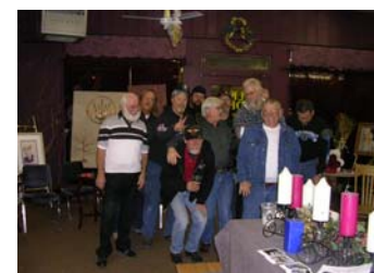
Photo of All the Guys