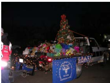
Look at All Those Toys!!

P.S. Don't forget the ABATE Flea Market on March 3, 2007 and I still need commitments from volunteers for the MRF Conference.