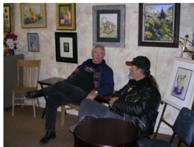
Dale and Rail