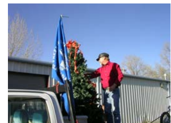
STAY!!!You stupid Tree.