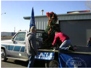
Setting up the Tree