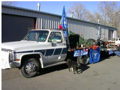
The Tree Kept Falling Over. . . . To be continued. . . .