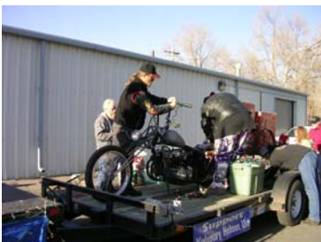
Strappin' down the Choppa'