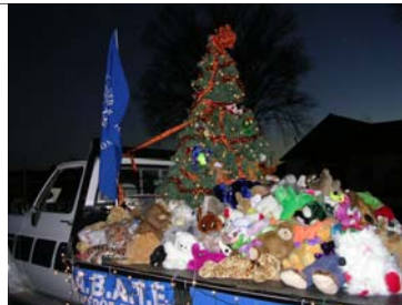
100's of Stuffed Animals