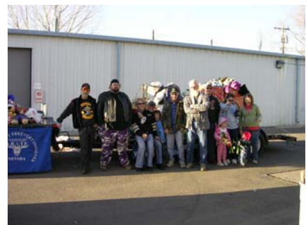
The Whole Float Building Bunch, less one photographer.