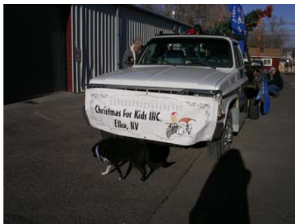
Christmas for Kids Leads the Way