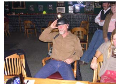
Aux. Headlamp for the Honda Choppa