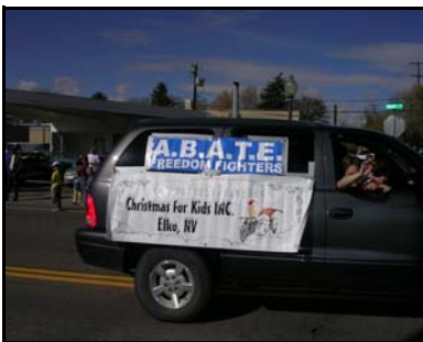
Nevada Day Parade